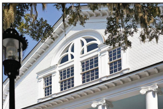
Hill Hall: Erected 1901